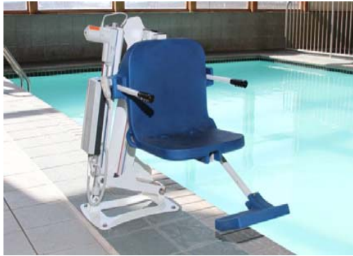
The Ranger Lift