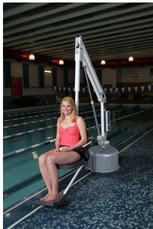
The Revolution Lift